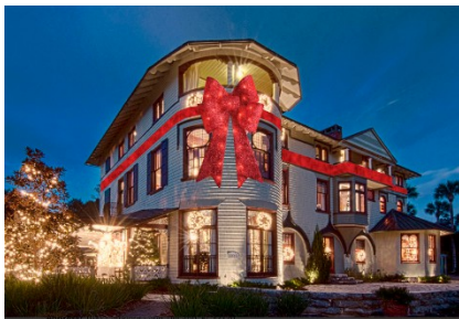
Spectacular at Stetson Mansion

Consisting of various tribes that shared a common language, the Timucua inhabited most of what is today Central and North Florida. What is a shell midden? How do you pronounce Timucua? How did they live? Where are they now? These questions and many more will be answered in this in-depth presentation about some of our state's earliest residents.